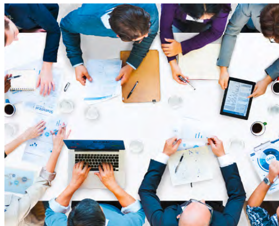
Consumer Council - Offices

The Consumer Council consists of the Executive Committee, with members carrying out their function on a voluntary basis. Meanwhile office staff are employees working on DIN premises.