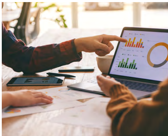
Consumer Council - Executive Committee

The DIN Consumer Council has been representing consumer interests in national, European and International standardization committees since 1974.