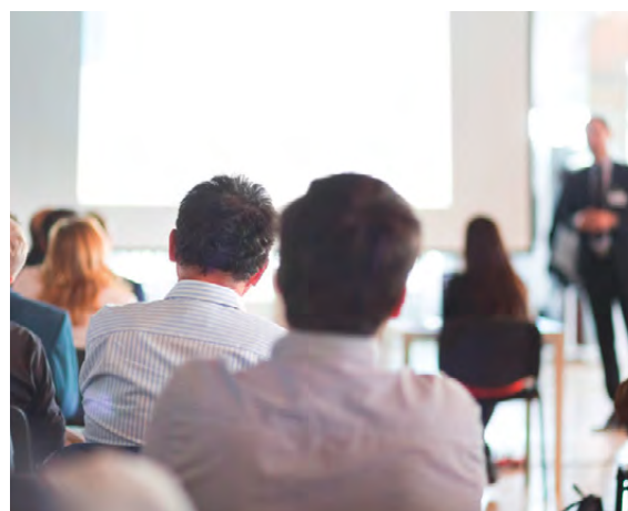
Consumer Council - Voluntary Consumer Representation

The Consumer Council's offices are part of the DIN structure and its staff members are employees of DIN. They represent consumer interests in standardization committees based on resolutions of the Consumer Council Presidial Committee.